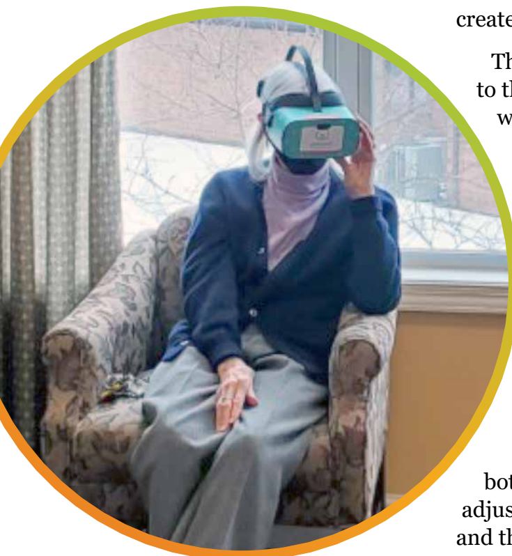
A resident at Ohio Living Breckenridge Village enjoying a VR session

VR sessions are hosted across all levels of care, in both a scheduled and ad hoc capacity. VR headsets are adjustable to accommodate each resident’s level of mobility, and the interactive view can even be simultaneously shown on a television, so a group can “travel” together.